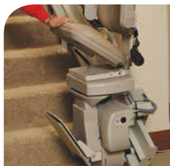
Power folding footrest automatically flips up/down when seat is raised/lowered.