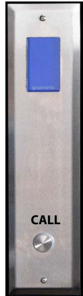
Figure 2 Hall Call Station

In the event of a building power failure, the door system is provided with a temporary power back-up system to continue the opening operation for a number of times. On resuming normal building power, the back-up system will turn OFF and begin automatically recharging.