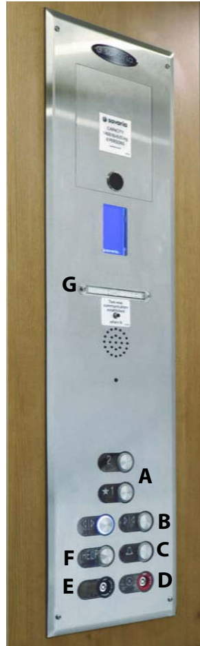
Figure 1 Keyed COP

This button can be pressed at any time to activate the optional hands-free phone in case of an emergency. The red light above the speaker will come on when two-way communication has been established. For units that have a standard hand-held phone, it is located in a separate phone cabinet in the cab.