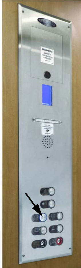
Figure 3 Door Open Button

When the elevator is at a landing level, the doors can be opened by pressing the Door Open button. Normally the doors will have opened and already closed automatically. The Door Open button allows the door to be reopened.